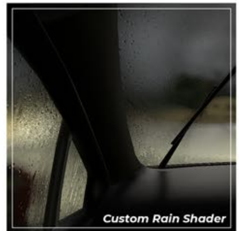
Custom Rain Shader