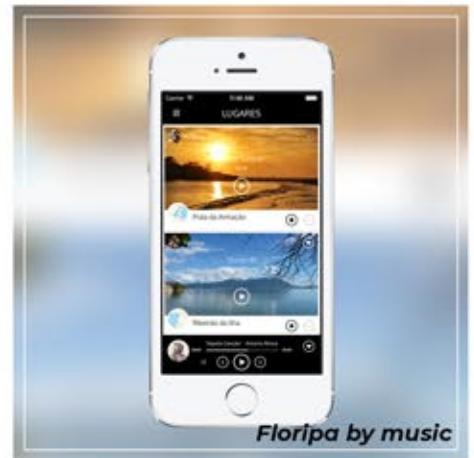
Floripa by music