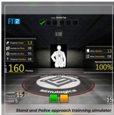
Stand and Police approach training simulator