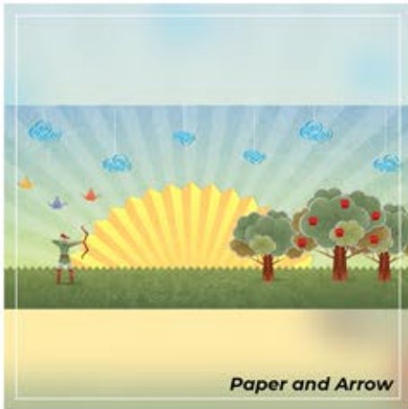
Paper and Arrow

For more, please visit: matheusfernandes.tech/portfolio