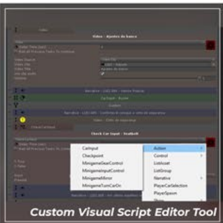
Custom Visual Script Editor Tool